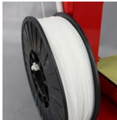
ABS material spool